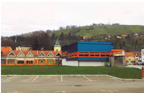
Workshop in Beltinci, Slovenia, 13/03/2013

Participants are invited from a variety of backgrounds and from those fields which may have relevant information or knowledge to contribute on the discussion on geothermal and District Heating in these countries. The target group of these two workshops includes national actors such as municipalities, public authorities, DH utilities and geothermal developers.