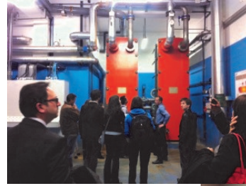
Workshop in Bordeaux, France, 27/03/2013

Eleven workshops were already successfully held in the following countries: Slovakia, the United Kingdom, Hungary, Italy, Denmark, Bulgaria, Slovenia, Poland, the Czech Republic, France and the Netherlands. More information, including all presentations, are available here!