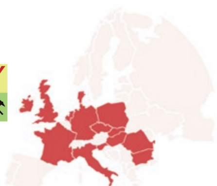
Target countries of the project