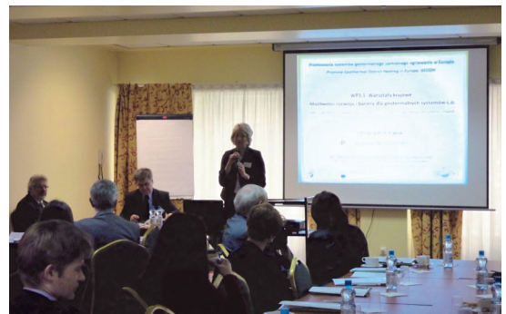
Workshop in Krakow, Poland, 19/03/2013