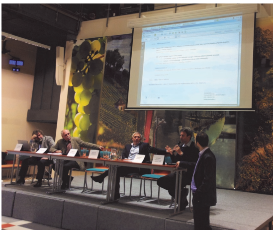
Workshop in Litomerice, Czech Republic, 25/03/2013

The aim of these workshops is to identify and assess barriers to geothermal DH projects in order to create and present recommendations for removing these barriers.