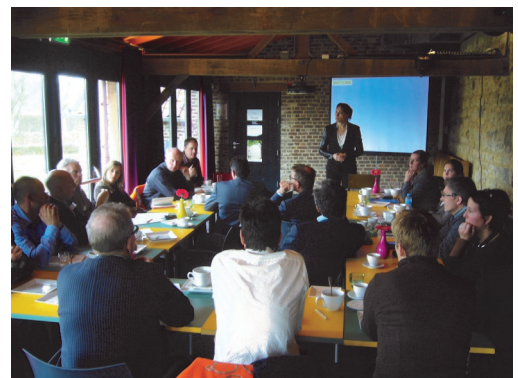
Workshop in Heerlen, The Netherlands, 03/04/2013